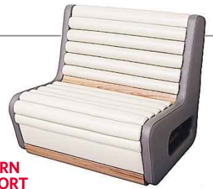
THINK FABRICATE Your LI Home

Here are some of our favorite products, from high-end custom pieces to more wallet-friendly accents: