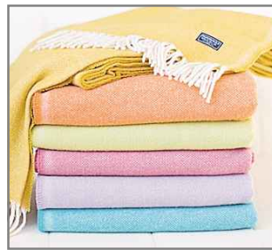
FARIBAULT WOOLEN MILL CO.

Sag Harbor furniture designer Nico Yektai is known for creating sculptural benches and tables. His Proteus candle holders are made of concrete and wood. The candle holders are sold in pairs ($160 a pair, in small, medium and large at nicoyektai.com/store) that are magnetically attracted to each other. Add more pairs to make a centerpiece or pull them apart into smaller groups. Each holder can accommodate a standard candle or tea light.