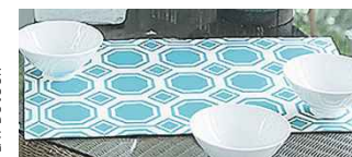
PLAT DU JOUR