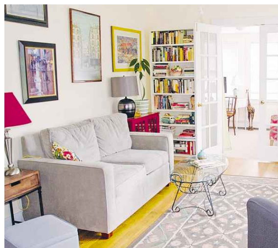
ANDREW STYPE REALTY