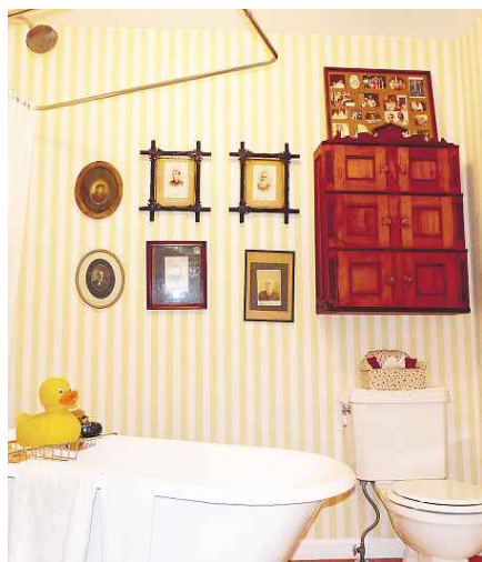
DOUGLAS ELLIMAN REAL ESTATE