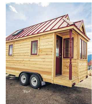
TUMBLEWEED TINY HOUSE COMPANY

Tumbleweed's 180-square-foot, 20-foot Cypress model, with sleeping loft above, starts at $61,000.