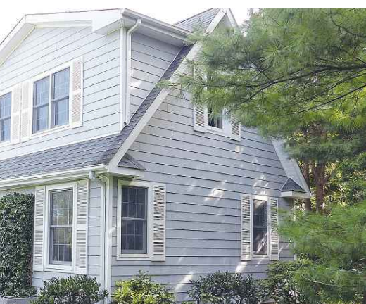
DOUGLAS ELLIMAN REAL ESTATE