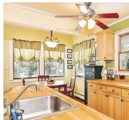
DANIEL GALE SOTHEY'S REALTY