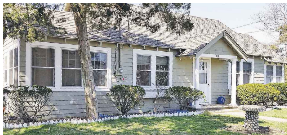
ANDREW STYPE REALTY